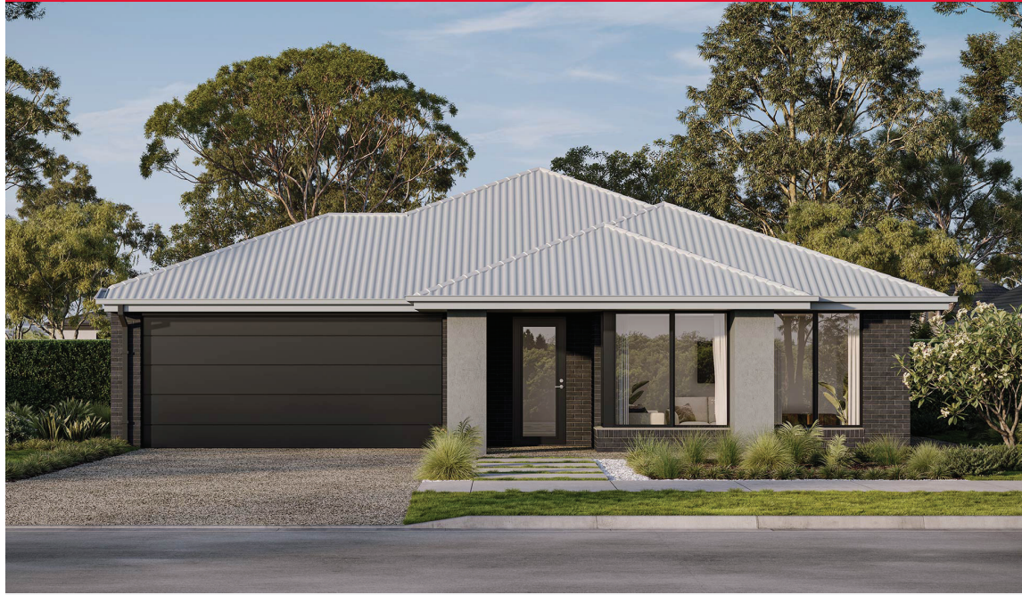
CYPRESS 26 | ELEVATE RANGE