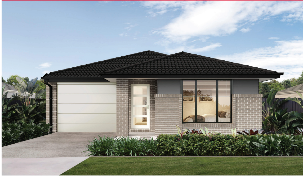
MARTIN 17_161 | METRO RANGE