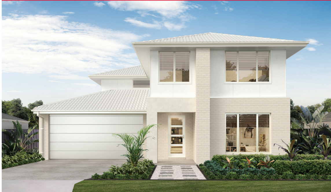
HAWKINS 24_226 | METRO RANGE