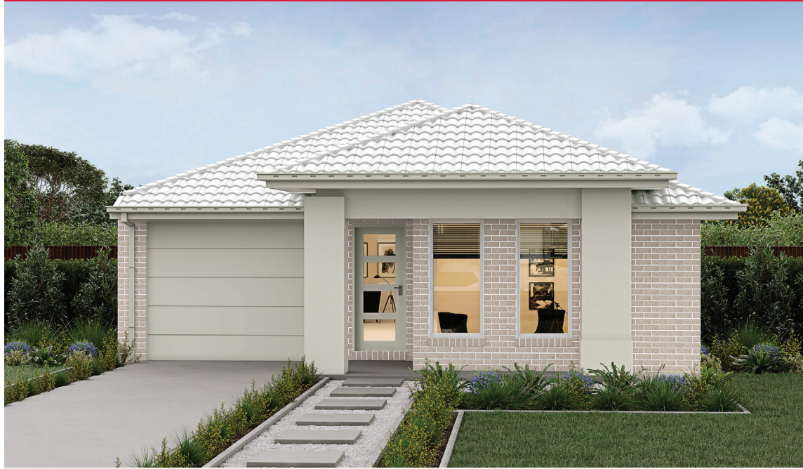
FIELDSTONE 13_129 | METRO RANGE