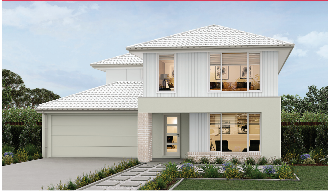
PEARSON 30_278 | METRO RANGE