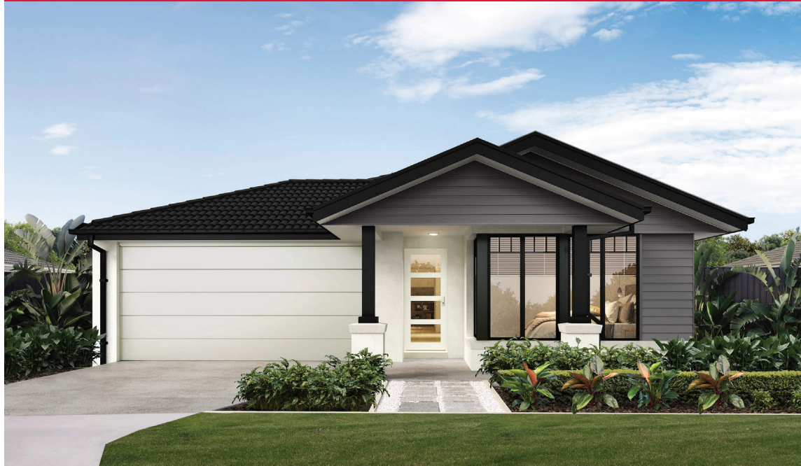
EMERSON 19_176 | METRO RANGE