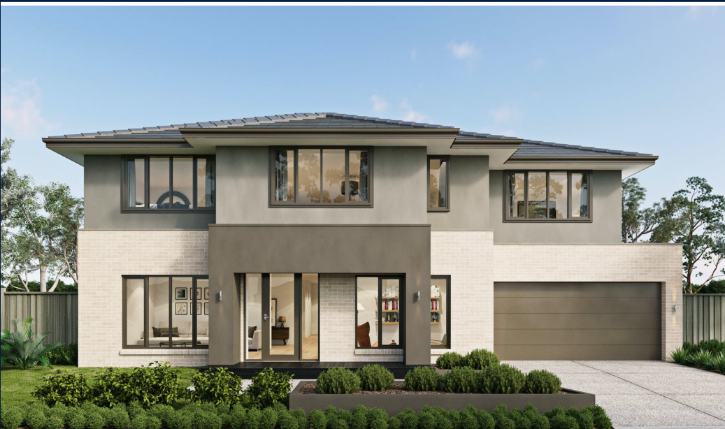
Price excludes upgrade items above standard specification such as feature render and bricks, front entrance timber decking, front entry door, brick infills above garage, external lighting, fencing, concrete paths and driveway. Façade Image may also contain items not supplied by Metricon Homes, namely landscaping and planter boxes.